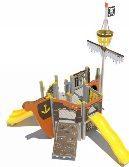
"Water Themed" Playground Equipment