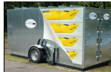
Kayak Rental & Storage