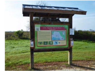
Information / Wayfinding Kiosk