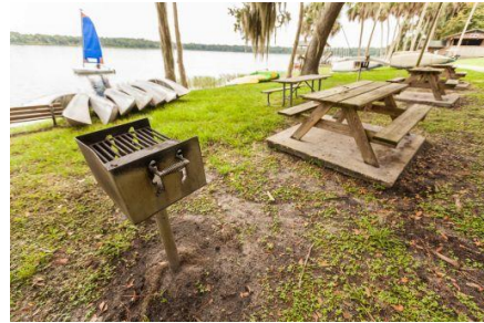
Picnic Tables, Benches, & Grills

History Goals Concept Amenities What's Next? Questions?