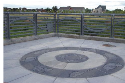
Scenic Overlook with Decorative Handrail